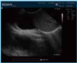
Feline Subhepatic effusion