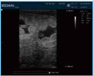
Canine intestinal canal