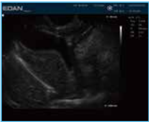
Canine Gall Bladder