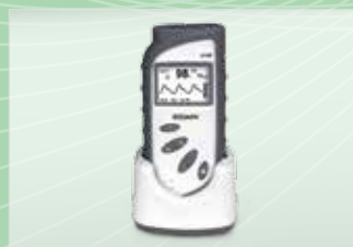
Battery Charger Stand