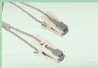
Unique Sensor Design