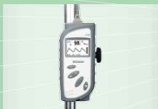
Bed Rail Mount